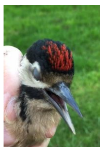
Great Spotted Woodpecker, blinking