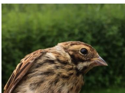
Juvenile Reed Bunting