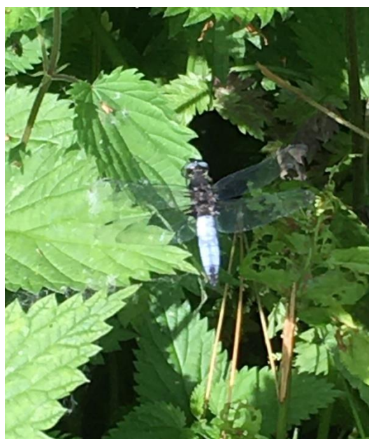
Male Scarce Chaser