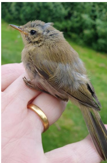
Chiffchaff, reluctant to leave