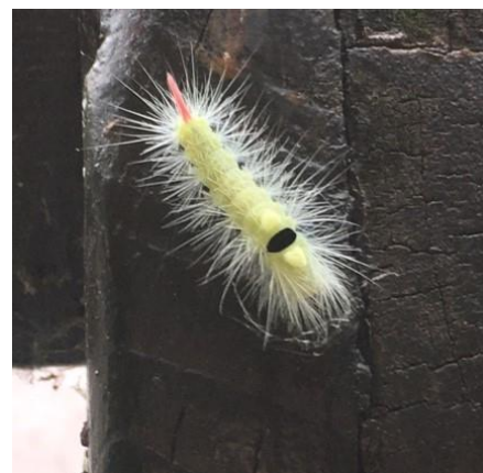
Pale Tussock moth caterpillar