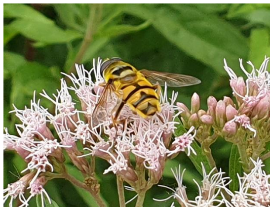
Yellow haired Sunfly