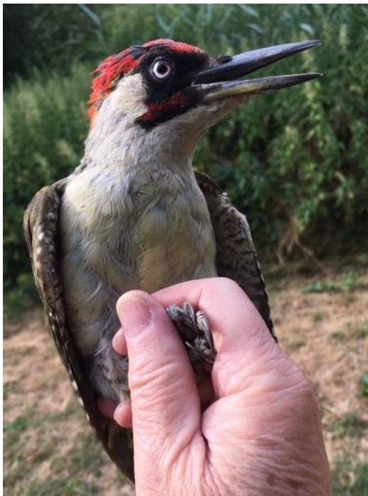
Adult male Green Woodpecker