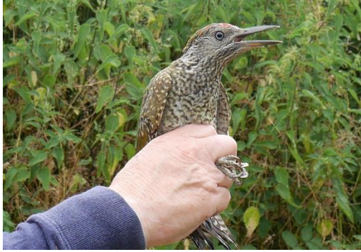
Juvenile Green Woodpecker