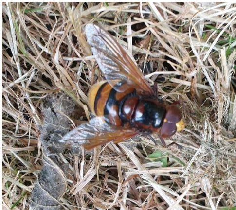
Hornet Mimic Hoverfly